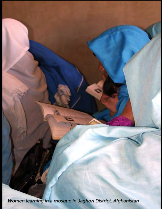
Women learning in a mosque in Jaghori District, Afghanistan

Communities reshape paths to their futures through learning. Outcomes differ by local context—but the process works anywhere. See how people are adapting for our changing world at May.Future.Edu