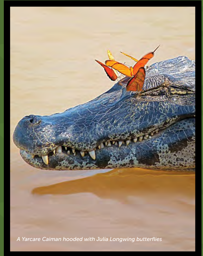
A Yacare Caiman hooded with Julia Longwing butterflies

Let's leave 2020 behind! This calendar shows communities taking off from dangers, generating their futures. Discover how at January.Future.Edu