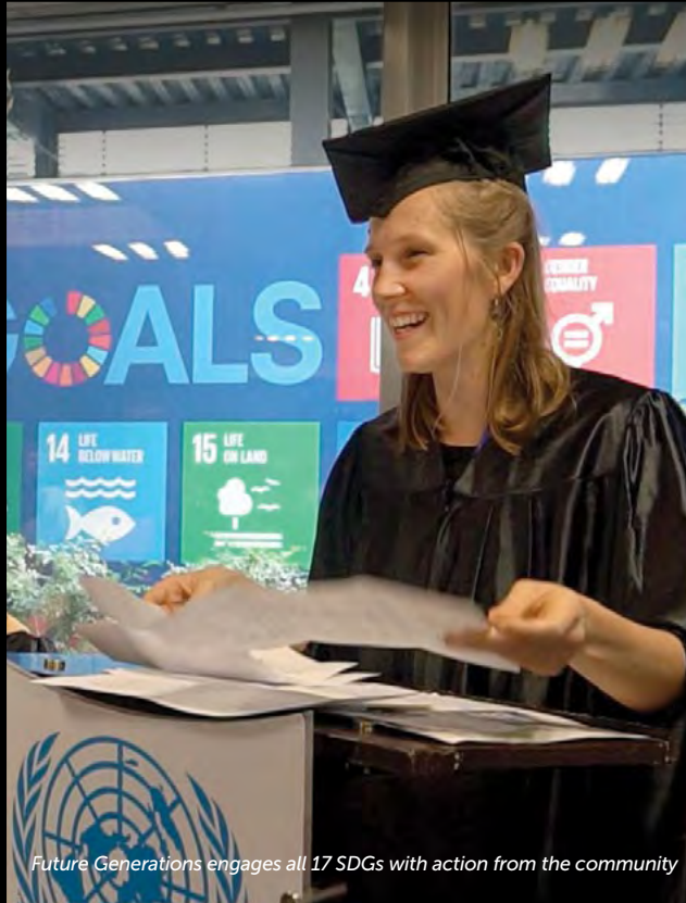
Future Generations engages all 17 SDGs with action from the community