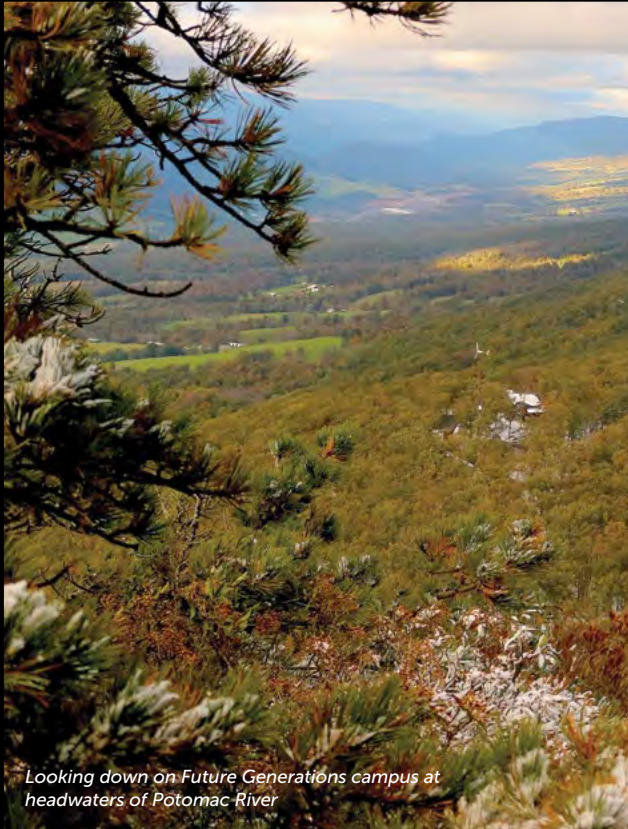
Looking down on Future Generations campus at headwaters of Potomac River