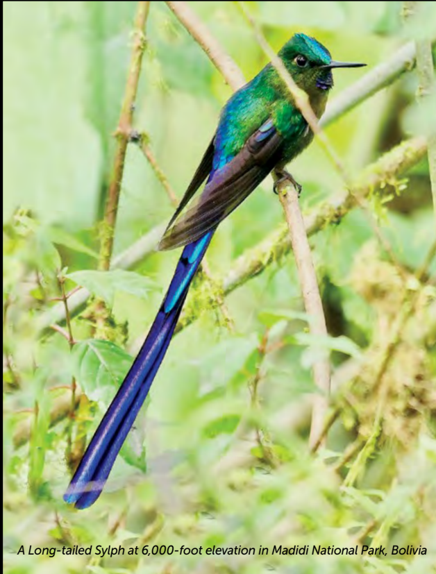
A Long-tailed Sylph at 6,000-foot elevation in Madidi National Park, Bolivia

Bird songs captured in terabytes of data from 22 monitoring stations in Nepal, Bolivia, Uganda, and USA inform our understanding of climate change. Learn how we listen to nature at April.Future.Edu