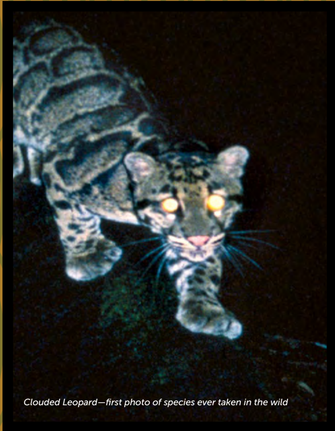
Clouded Leopard—first photo of species ever taken in the wild